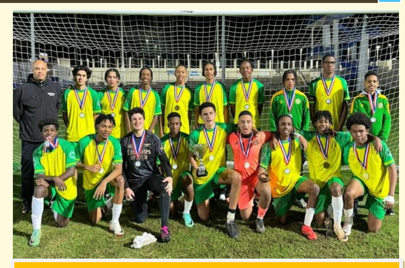
Berkeley Pride: Our footballers (over-16) defeated Mount Saint Agnes in Saturday's game!

"The mission of The Berkeley Institute, a diverse senior school with a rich heritage and tradition of excellence, is to ensure a stimulating learning environment that prepares all of its students to lead full and purposeful lives and to assume leadership roles in both the local and global communities." Revised April, 2019