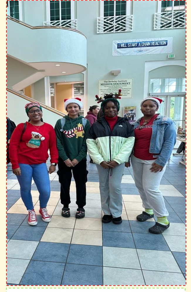
Students dressed in their festive attire for last week's Holiday Grub Day