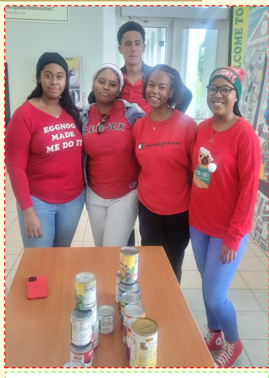
S4 Prefects spreading some holiday cheer