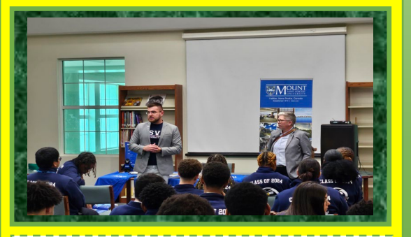
'Truth Leads to God'