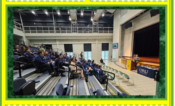
Whole Leaders for the Whole World