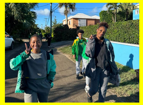
#Peace and Love